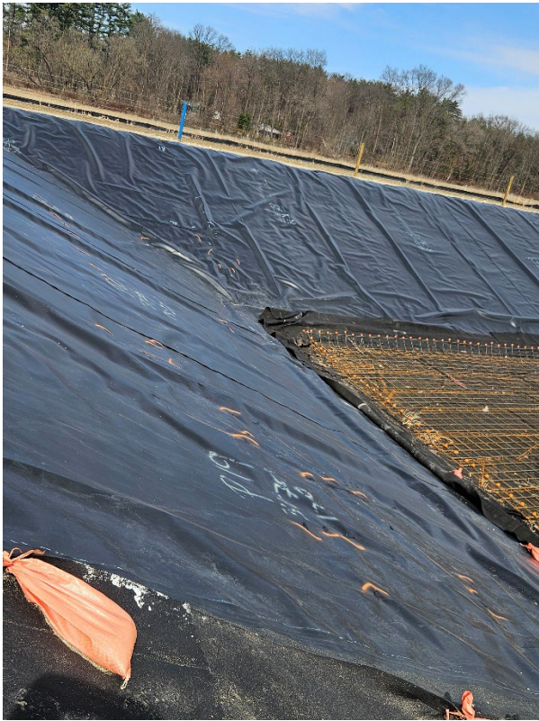
Repairs completed in the Liner.